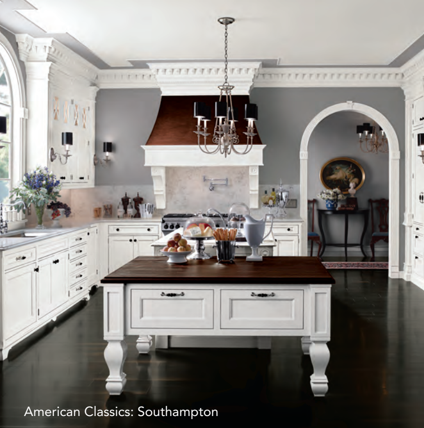
American Classics: Southampton