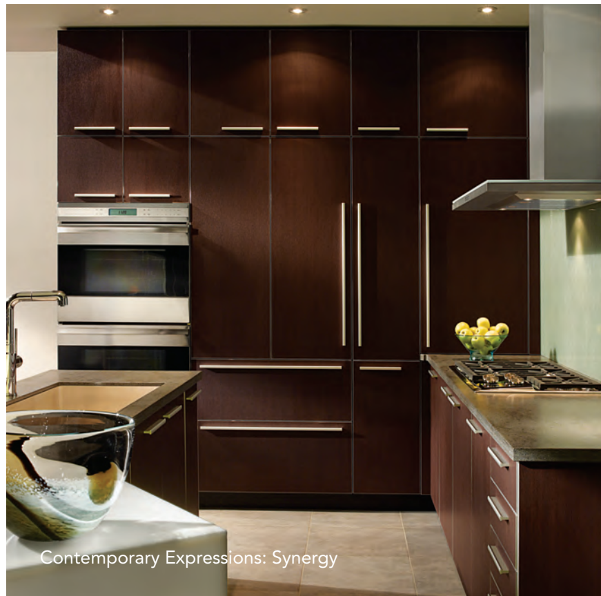
Contemporary Expressions: Synergy