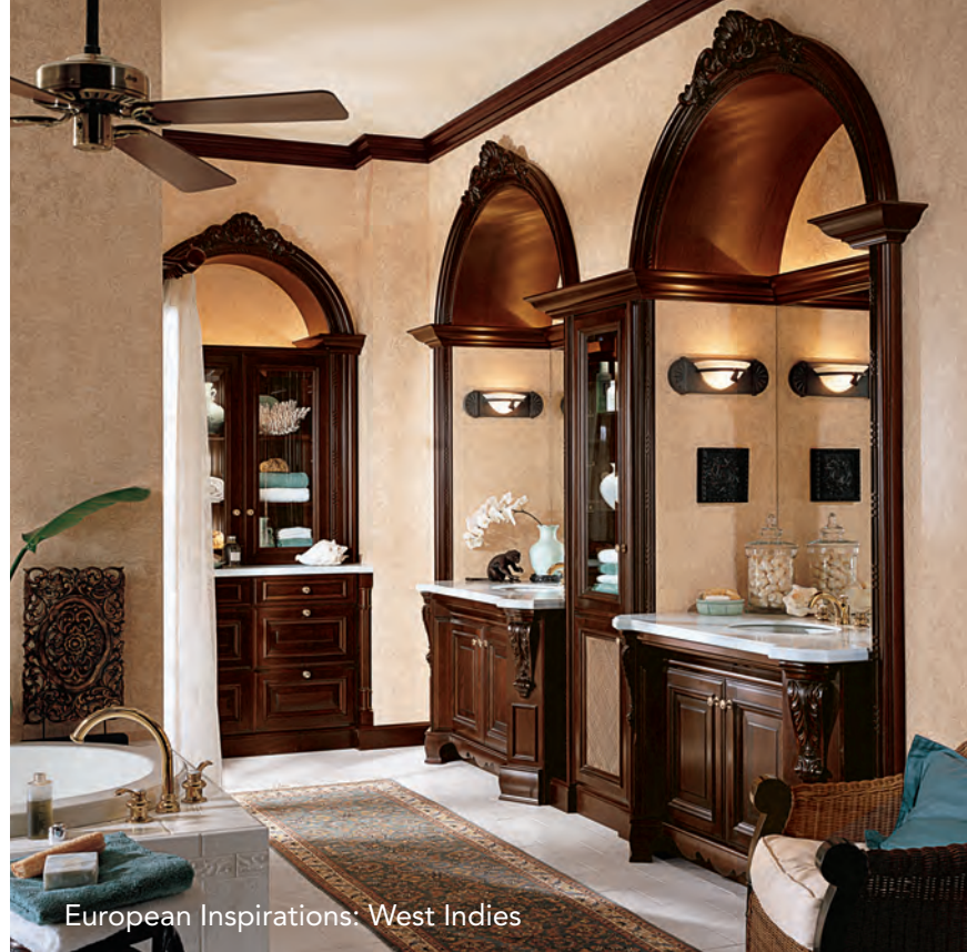
European Inspirations: West Indies